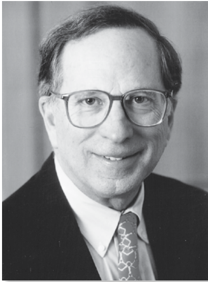
Senator Sam Nunn

Sam Nunn is the co-chairman and chief executive officer of the Nuclear Threat Initiative (NTI), a charitable organization working to reduce the global threats from nuclear, biological, and chemical weapons. He served as a U.S. Senator from Georgia for twenty-four years (1972–1996) and is retired from the